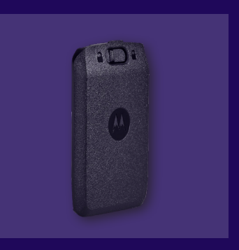
HKNN4013ASP01 BT90 Standard Capacity Battery