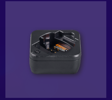
PMPN4587 SINGLE-UNIT CHARGER