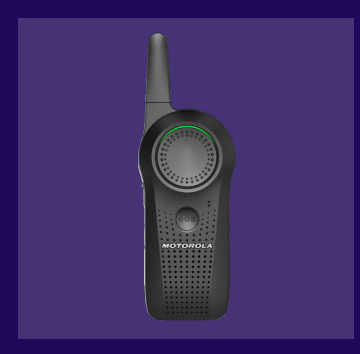
PMUF1983 Curve Radio