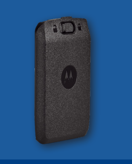
HKNN4013ASP01 BT90 Standard Capacity Battery