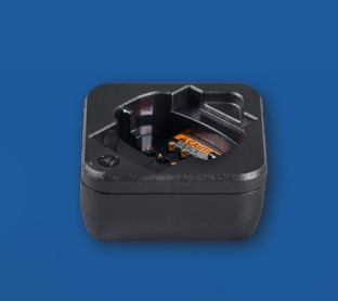
PMPN4587 Single-unit charger